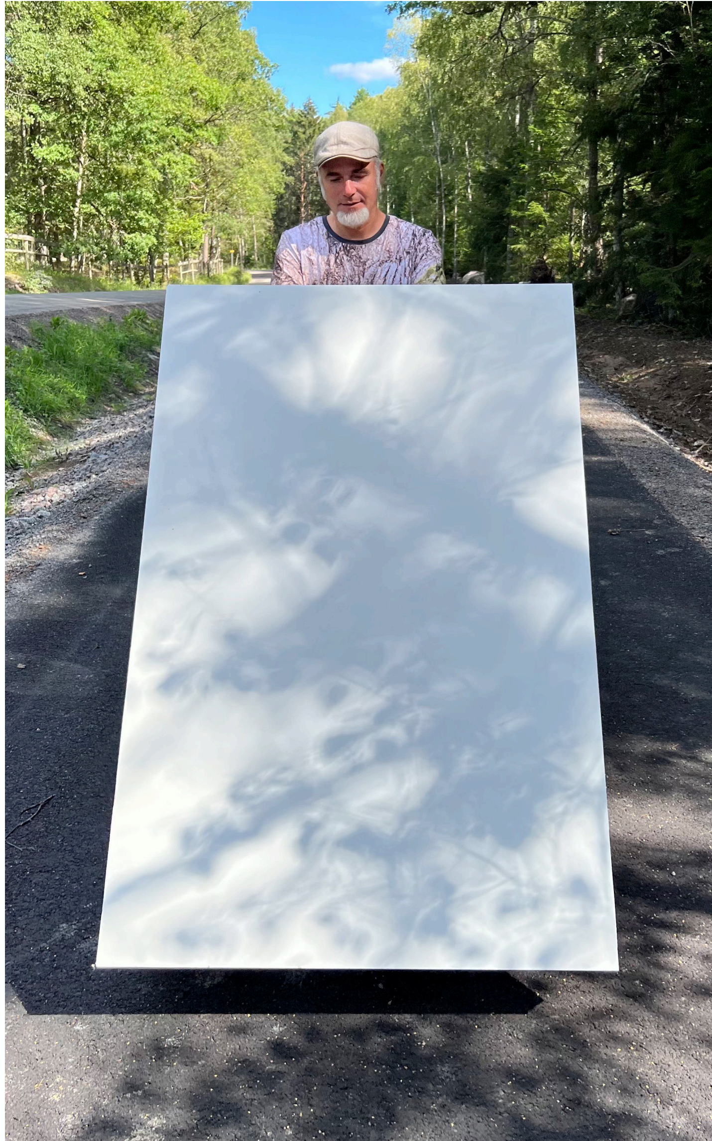
Screenshot from video